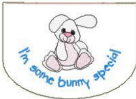
File: ImSomeBunnySpecial.pes Stitches: 7002 Size: 174.9x126.1 mm