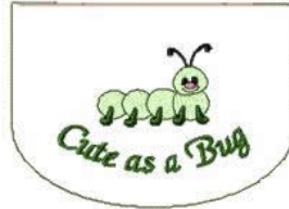
File: CuteAsABug.pes Stitches: 6770 Size: 174.9x126.1 mm