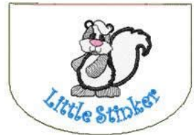
File: LittleStinker.pes Stitches: 9484 Size: 174.9x126.1 mm