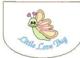
File: LittleLoveBug.pes Stitches: 6507 Size: 174.9x126.1 mm