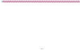
File: rickrack.pes Stitches: 1447 Size: 173.0x108.4 mm