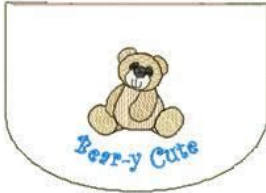
File: BearyCute.pes Stitches: 5538 Size: 174.9x126.1 mm