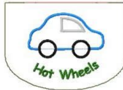
File: BoyBib02.pes Stitches: 6889 Size: 174.9x127.1 mm