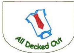
File: BoyBib04.pes Stitches: 7670 Size: 174.9x127.1 mm