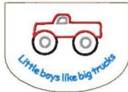
File: BoyBib01.pes Stitches: 8841 Size: 174.9x127.1 mm