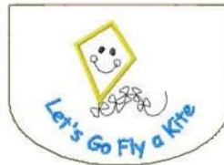
File: BoyBib05.pes Stitches: 4837 Size: 174.9x127.1 mm