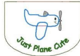
File: BoyBib06.pes Stitches: 5624 Size: 174.9x127.1 mm