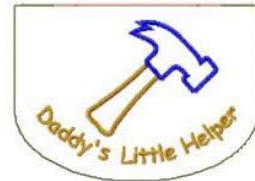
File: BoyBib03.pes Stitches: 5818 Size: 174.9x127.1 mm