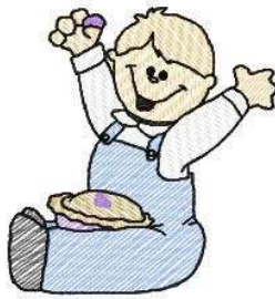
File: LittleJackHorner.pes Stitches: 3642 Size: 2.76x2.96 "