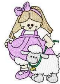
File: MaryhadALittleLamb.pes Stitches: 5923 Size: 2.74x3.91 "