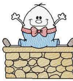
File: HumptyDumpty.pes Stitches: 7638 Size: 3.75x3.90 "