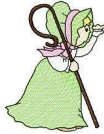
File: LittleBoPeep.pes Stitches: 4737 Size: 3.06x3.91 "