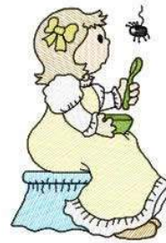
File: LittleMissMuffett.pes Stitches: 5276 Size: 2.68x3.91 "