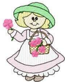
File: MaryMaryQuiteContrary.pes Stitches: 6042 Size: 3.07x3.91 "