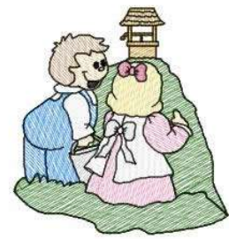
File: JackAndJill.pes Stitches: 6819 Size: 3.69x3.90 "