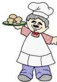
File: Pat-A-Cake.pes Stitches: 4346 Size: 2.78x3.90 "