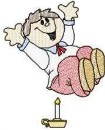
File: JackBeNimble.pes Stitches: 4681 Size: 3.13x3.91 "