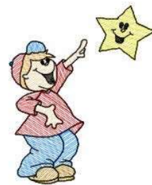
File: StarLightStarBright.pes Stitches: 3822 Size: 3.17x3.89 "