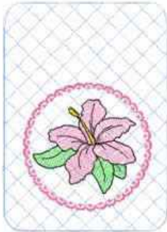
File: ITHQuiltedPurse2-04.pes Stitches: 7870 Size: 129.2x179.3 mm