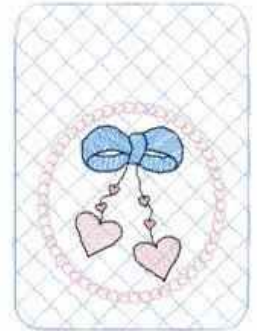
File: ITHQuiltedPurse2-06.pes Stitches: 5728 Size: 129.2x179.3 mm