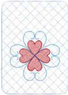
File: ITHQuiltedPurse2-01.pes Stitches: 4224 Size: 129.2x179.3 mm