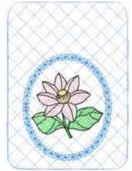
File: ITHQuiltedPurse2-03.pes Stitches: 7380 Size: 129.2x179.3 mm