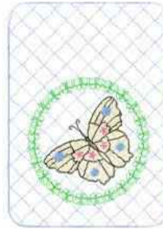
File: ITHQuiltedPurse2-02.pes Stitches: 7048 Size: 129.2x179.3 mm