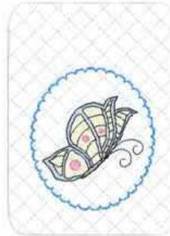
File: ITHQuiltedPurse2-05.pes Stitches: 6783 Size: 129.2x179.2 mm