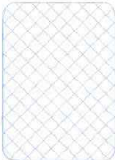
File: JustQuiltedFront.pes Stitches: 1597 Size: 129.2x179.3 mm